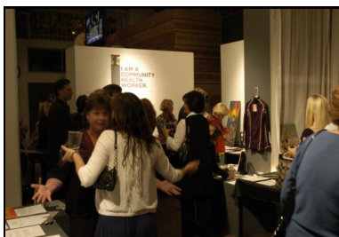
People enjoy good food, drinks, and conversation while they bid on over 80 auction items

On October 2, 2010, Med25 held a Silent Auction Fundraiser at the Ouch My Eye Art Gallery in downtown Seattle. Competing with local sporting events and football games on TV, we weren't quite sure what to expect. The evening far exceeded our expectations with 150 people in attendance and $13,485 raised towards staff salaries for 2011.